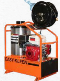
EZ03504G-H/ST With Optional Hose Reel