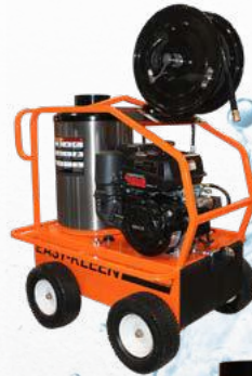
EZ04035G-K-GP-12/RTL Rental Frame Option with Grab Bar Surround for easy loading and total protection

Our most popular and versatile units. Utilized by a multitude of businesses for a wide variety of cleaning needs. From a simple oil field application to daily construction and farm use. Our customers continuously comment on the heat and speed of cleaning with these machines.