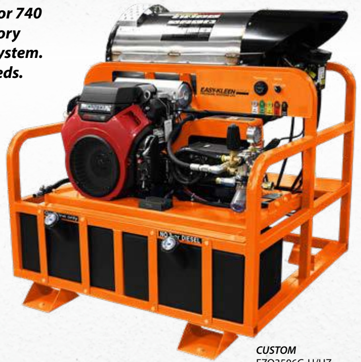
CUSTOM EZO3506G-H/HZ Wide Frame, Horizontal Coil Option 13 to 24 HP 44" L x 49" W x 49" H