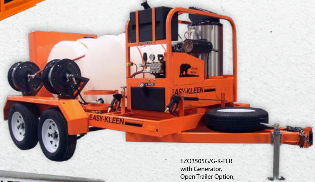
EZO3505G/G-K-TLR with Generator, Open Trailer Option, and two Hose Reels