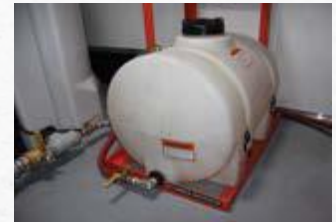
35 Gallon Antifreeze Tank