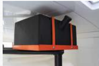
10 Gallon Chemical Tank