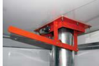
Exhaust Vent With Burner Safety Switch