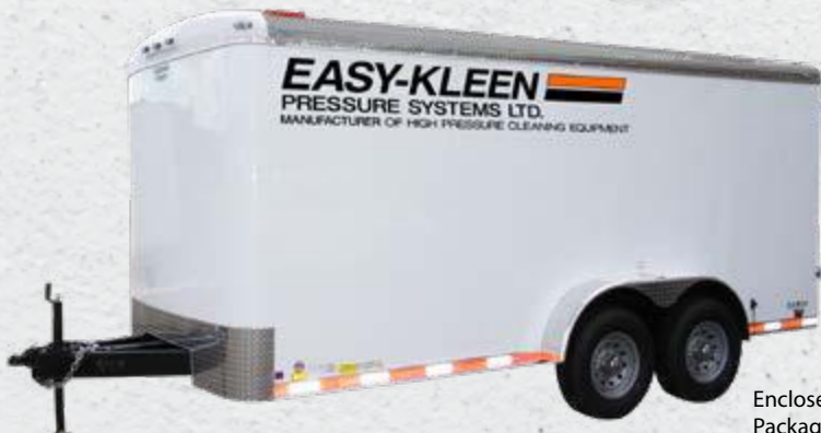
Enclosed Trailer Packages Available