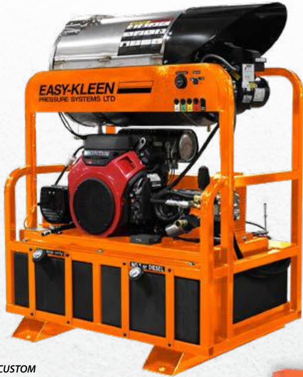
CUSTOM EZO3506G-H/HZ Narrow Frame, Horizontal Coil Option 13 to 24 HP 45" L x 35" W x 58" H

These units can also be upgraded to a horizontal frame, or mounted on a skid frame in combination with 225, 525, or 740 gallon water tanks and a variety of hose reel and accessory options to create a totally customizable self contained system. The footprint of this unit can be adjusted to suit your needs.