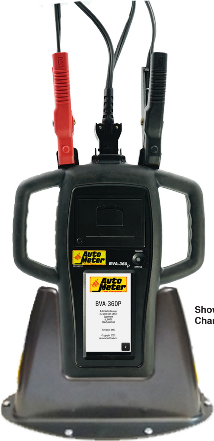
Shown with Optional AC-122 Charging Dock.