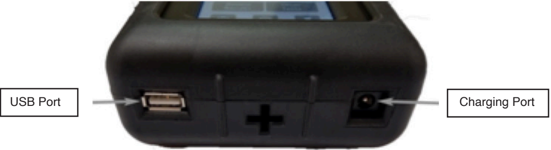
The BVA-360 should be plugged in when not in use.