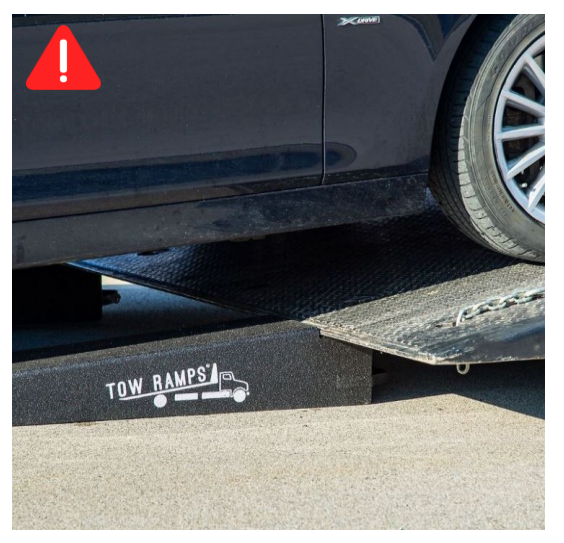
Fig. 2: Be careful to properly position the flatbed/trailer bed on the notch. DO NOT USE EXCESSIVE FORCE.