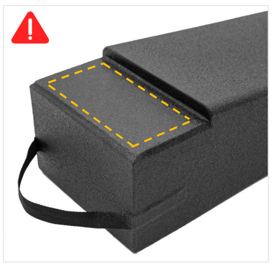
Fig. 1: <u>Gently</u> lower the flatbed/trailer bed and place on the Tow Ramp notch.