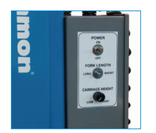
Operator console mounted to back of mast