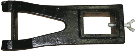
Steel Arm Casting (92000-001) shown with thumb screw