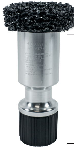
1/2" Drive Socket