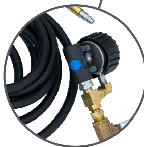
E. Quick-Connect Coupler makes connection fast & easy