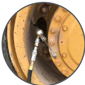
D. Large Bore Core Tool fastens to the valve for faster flow during inflation/deflation