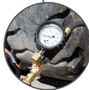
E. Liquid Dial Gauge ensures accuracy