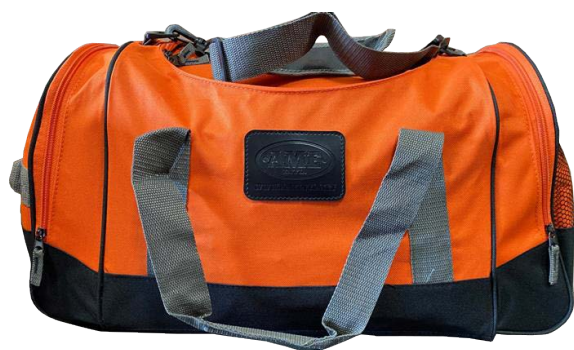
Kit Components Listed on Back